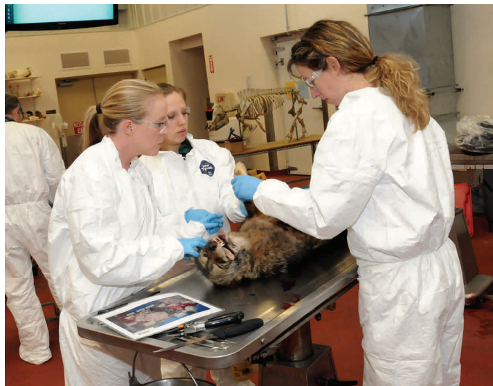
Workshop participants conducting a necropsy of a coyote.

The Northeast Wildlife Disease Cooperative (NEWDC) conducted two workshops, "Field Investigation of Wildlife Mortalities" in March 2012. The first was held at the Connecticut